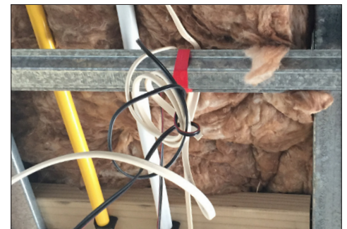
Typical cable installation